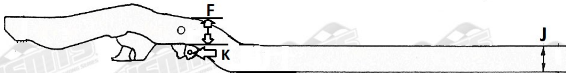
1968 - 1972 GM Chevelle Frame